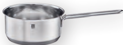
BASIC LINE SAUTÉ PAN Ø 16 CM

Capacity: 5.8 L Item no.: 137223 | 9.4 inch