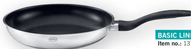
BASIC LINE FRYING PAN Ø 28 CM