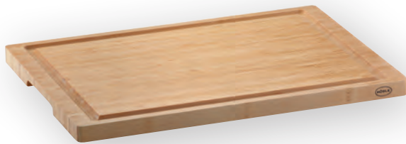
BAMBOO CUTTING BOARD