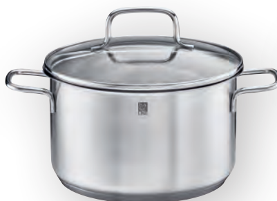
BASIC LINE HIGH CASSEROLE Ø 20 CM

Capacity: 2.0 L Item no.: 13721 | 6.3 inch