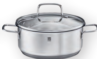
BASIC LINE LOW CASSEROLE Ø 20 CM

Capacity: 1.5 L Item no.: 13720 | 6.3 inch