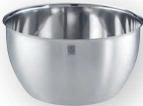
BOWL Ø 16 CM