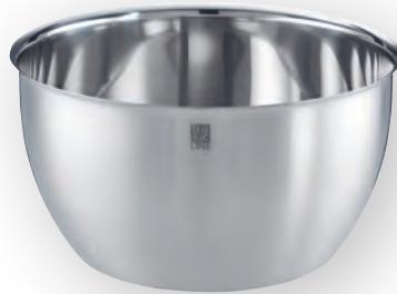
BOWL Ø 20 CM